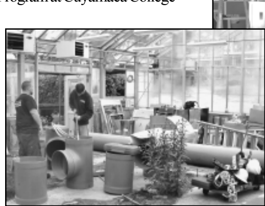
OH Greenhouse renovations.

began with four classes and about seventy students in two majors taught by one instructor. The classes were offered in a